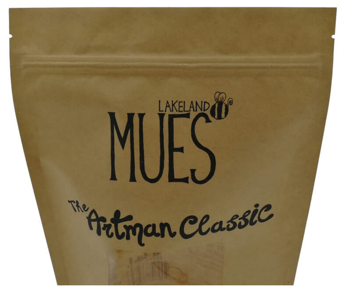
The Picture of biodegradable valve for the packaging bags