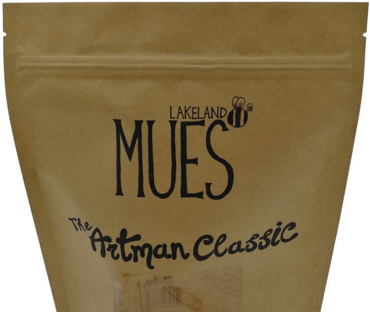
The Picture of biodegradable valve for the packaging bags