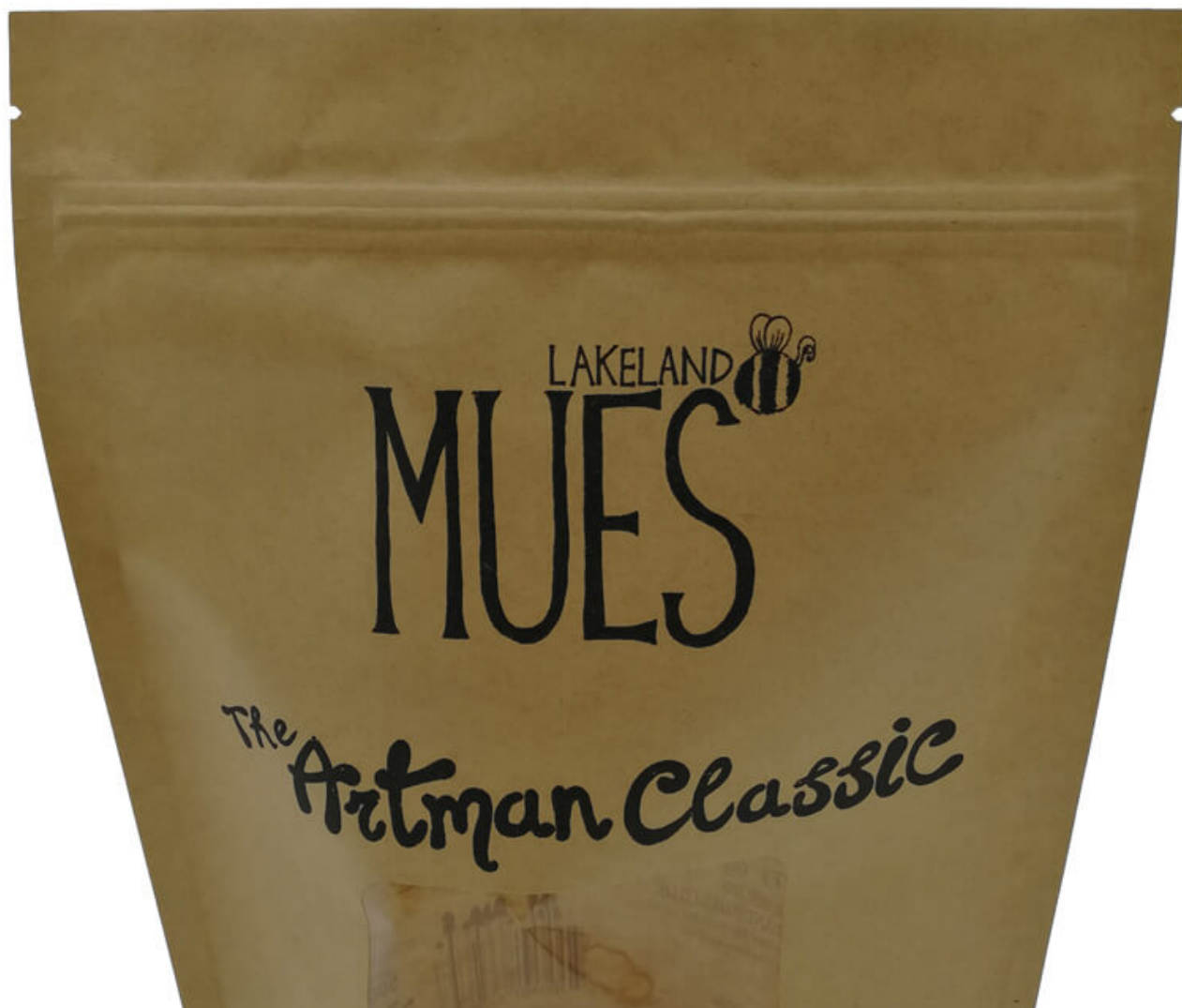
The Picture of biodegradable valve for the packaging bags