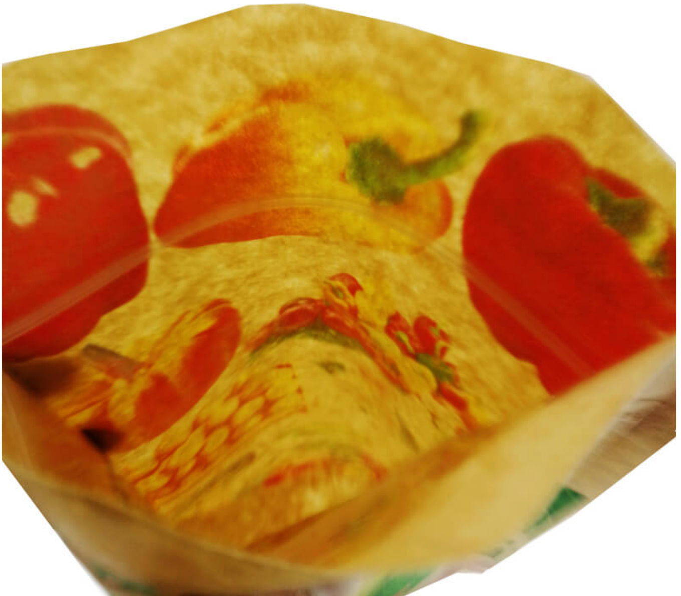
The Picture of biodegradable valve for the packaging bags