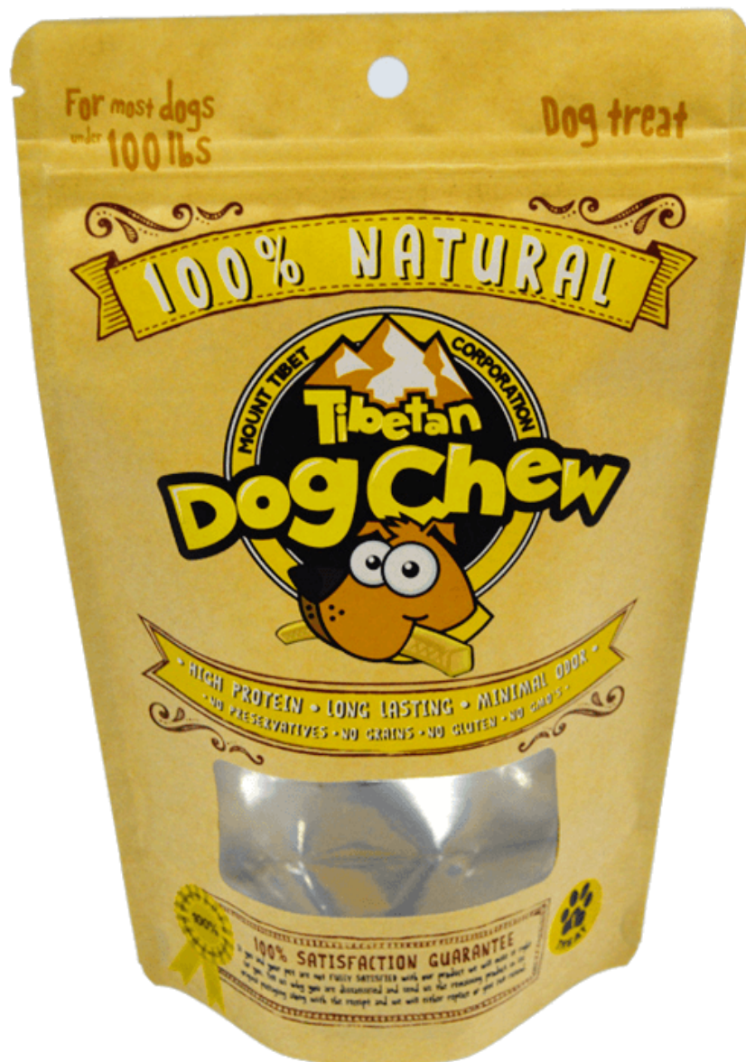
The other styles pet food packaging bags