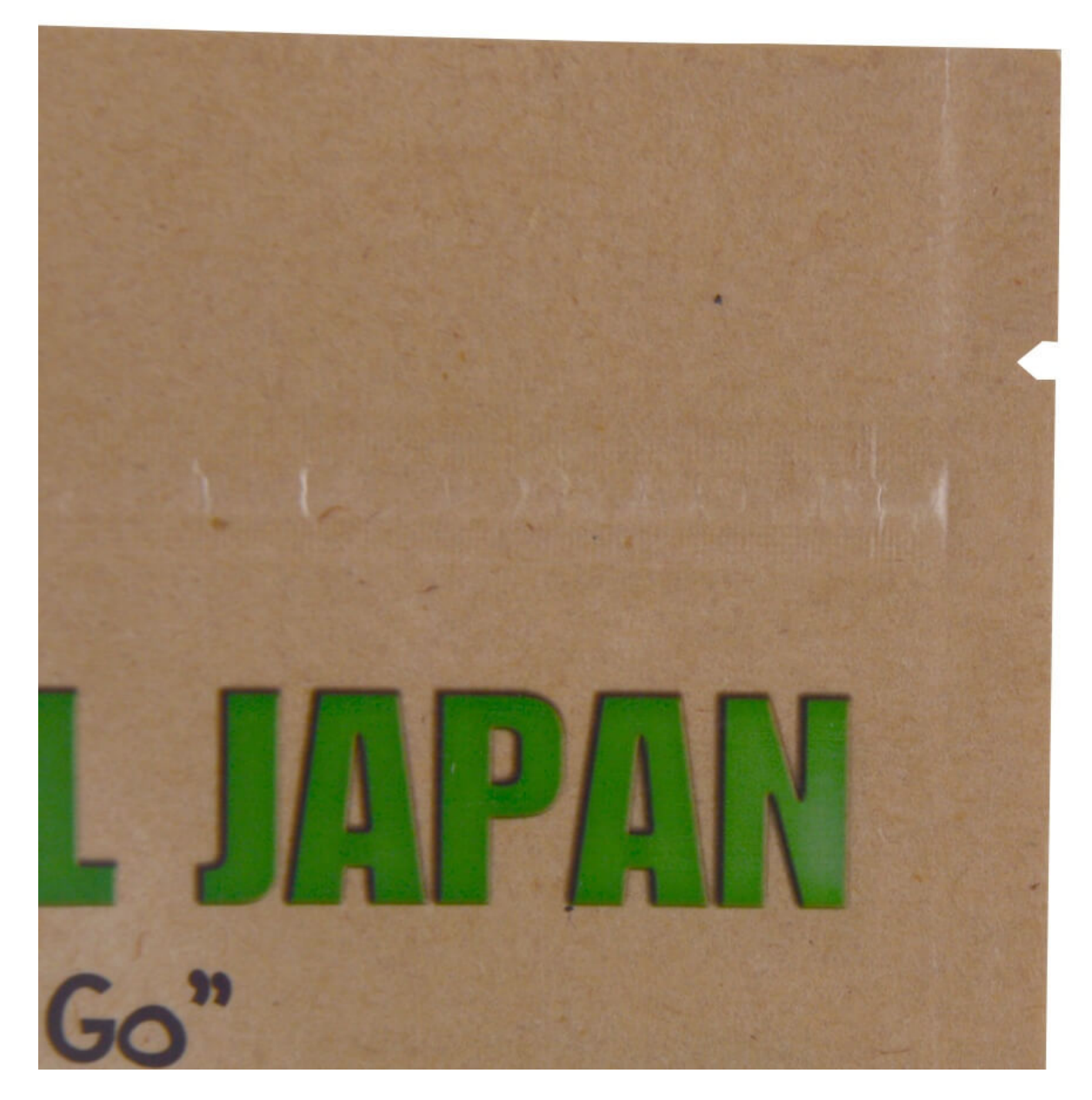
The Picture of biodegradable valve for the packaging bags