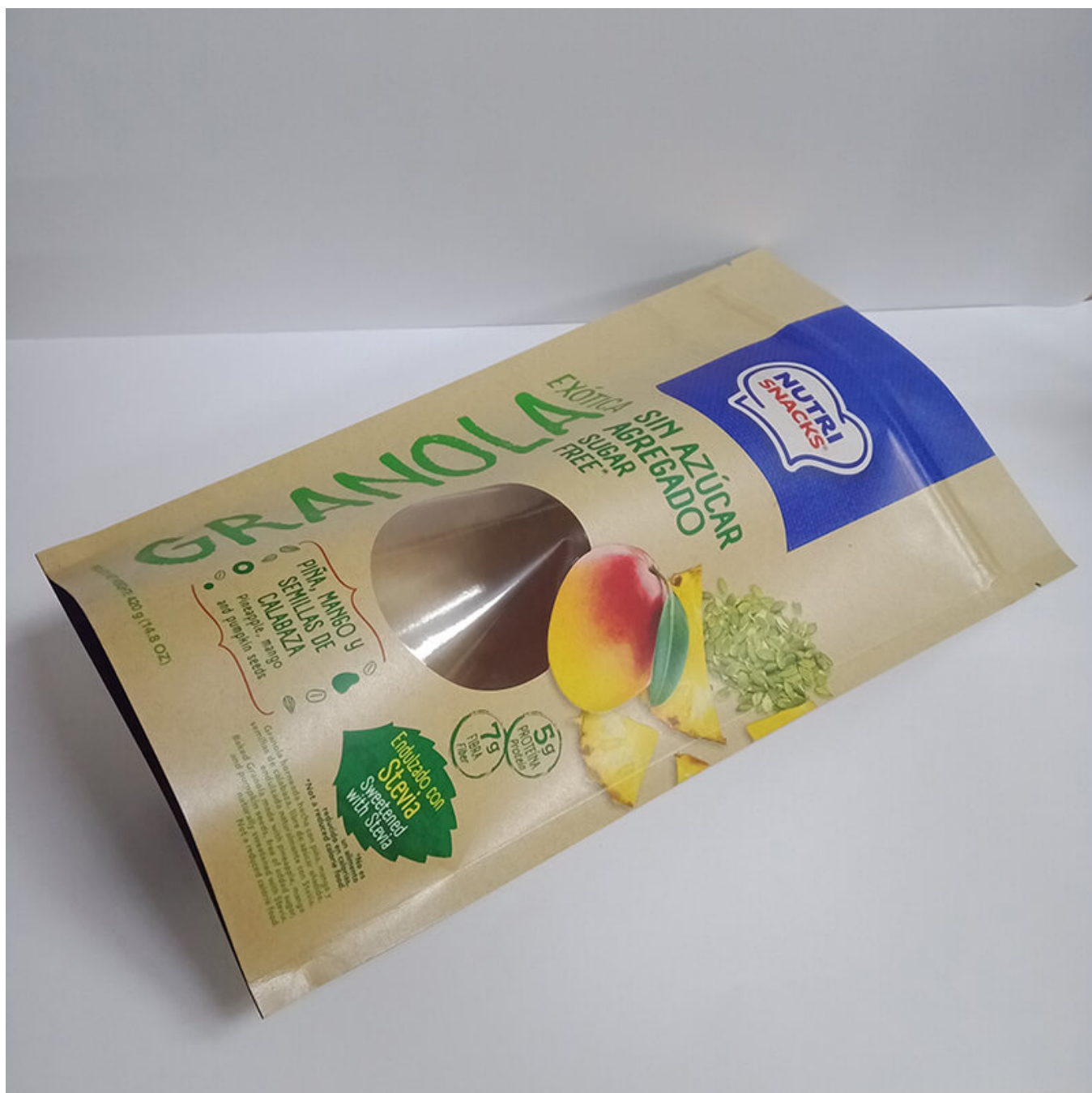
The Picture of biodegradable valve for the packaging bags