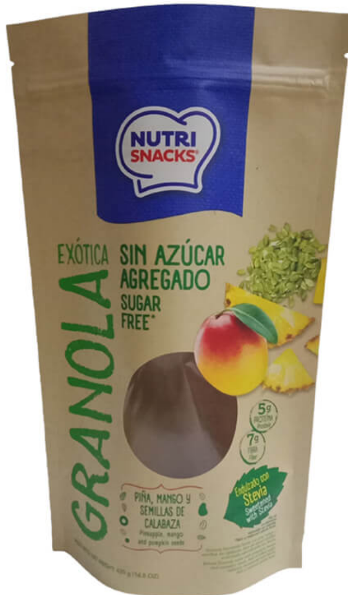
The detail data of Dried fruit and nut packaging bags