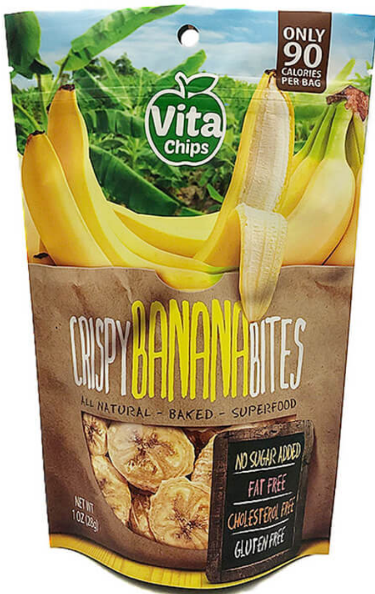
The detail data of Dried fruit and nut packaging bags