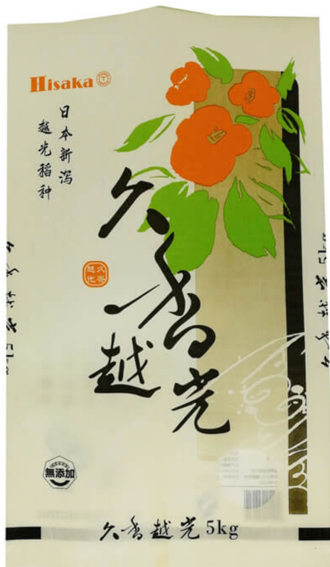
The Picture of biodegradable valve for the packaging bags