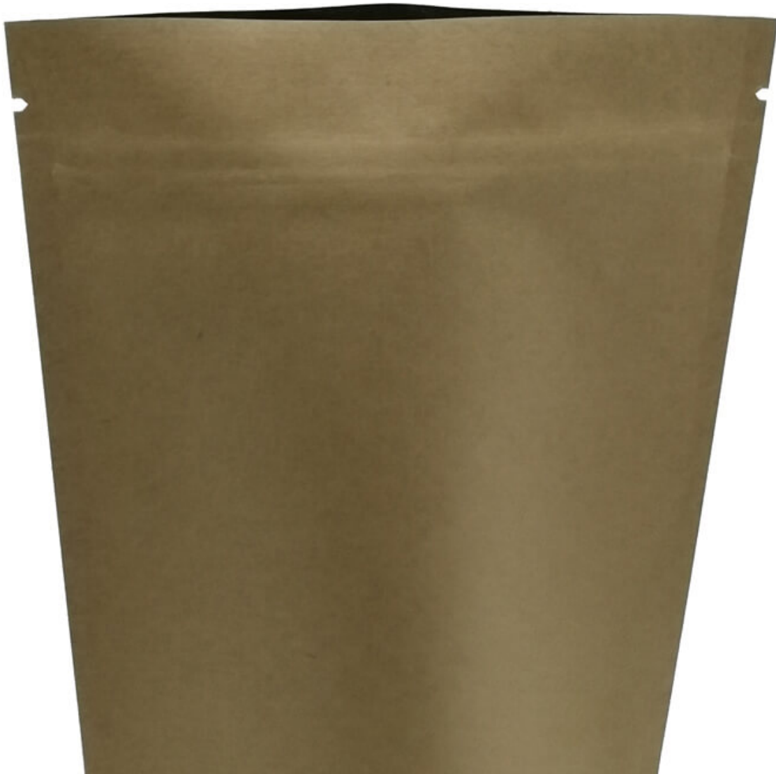
The Picture of biodegradable valve for the packaging bags