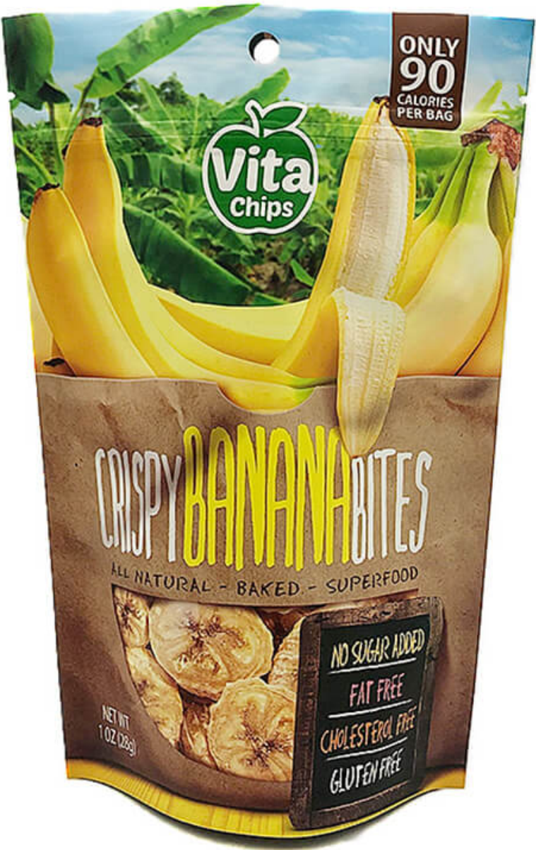
The detail data of Dried fruit and nut packaging bags

Colorful printed recycle dried fruit packaging bag with biodegradable valve