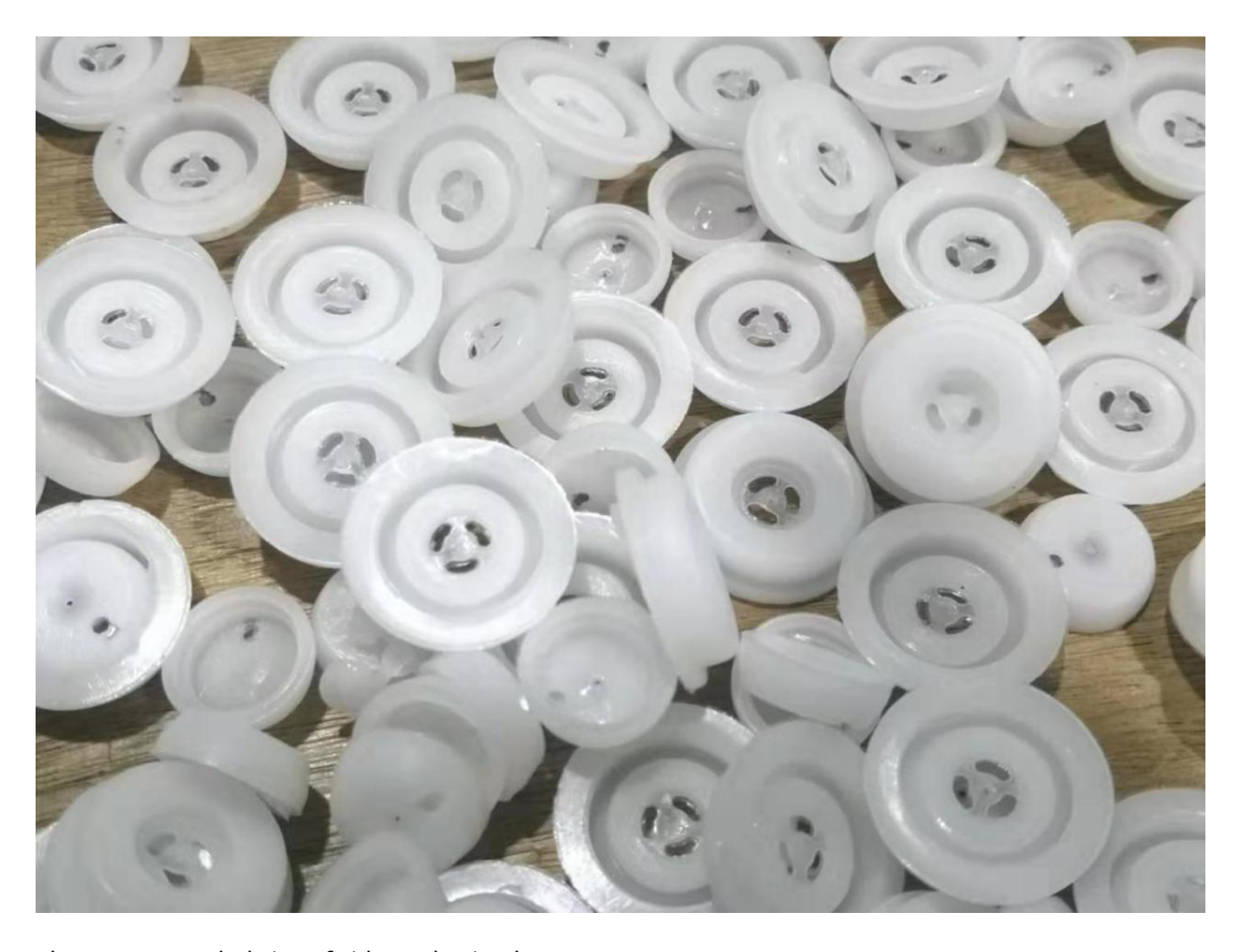
The recommended size of side packaging bags