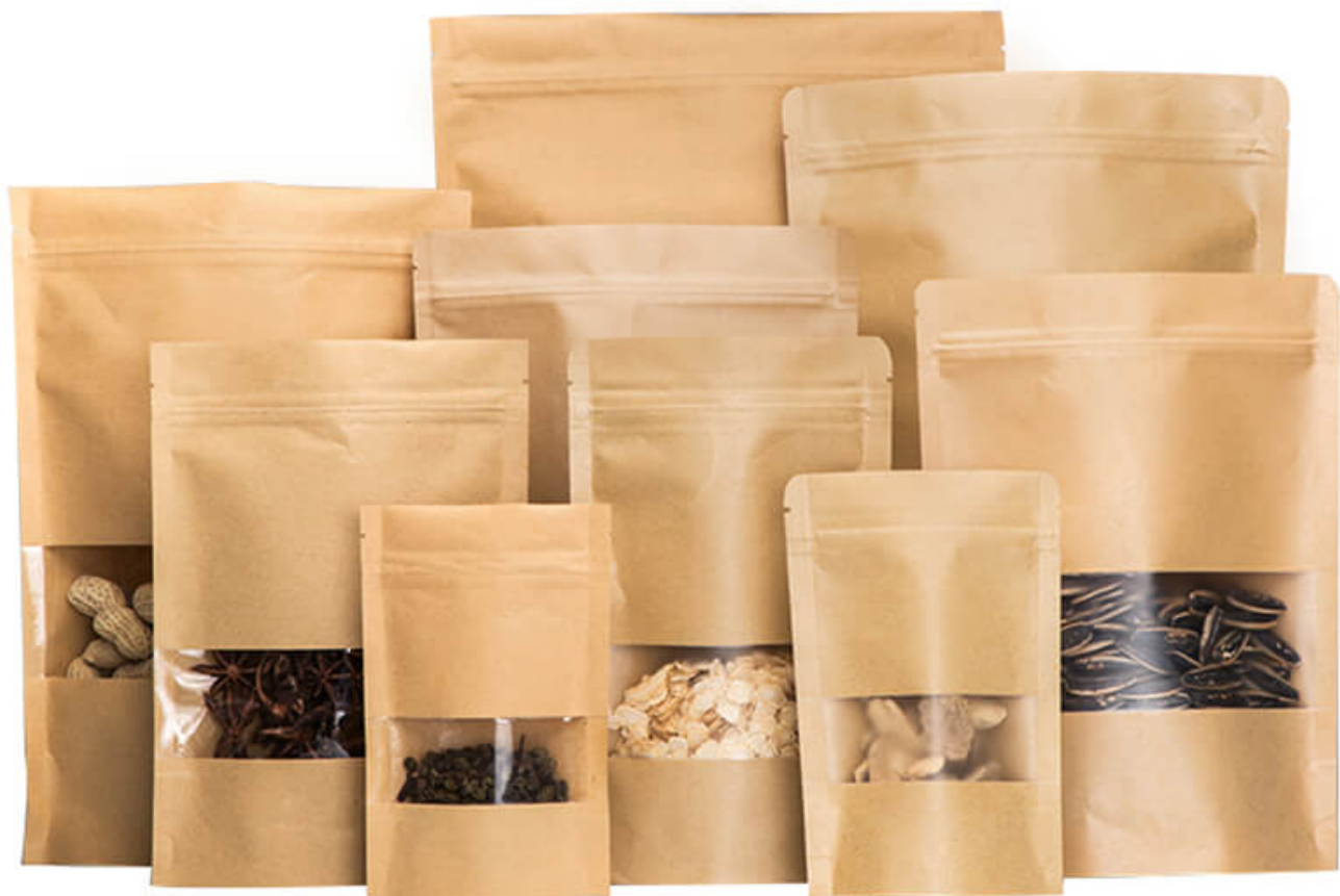
The detail data of health food & baking food pouch