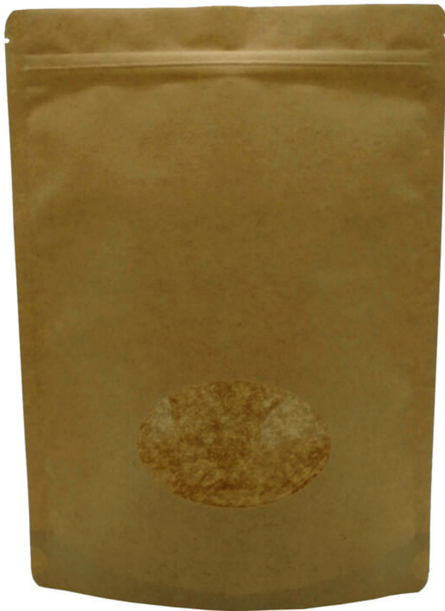
The Picture of biodegradable valve for the packaging bags