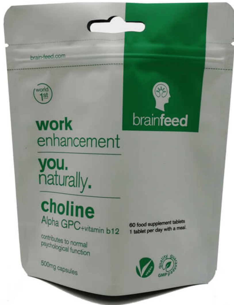
The Picture of biodegradable valve for the packaging bags