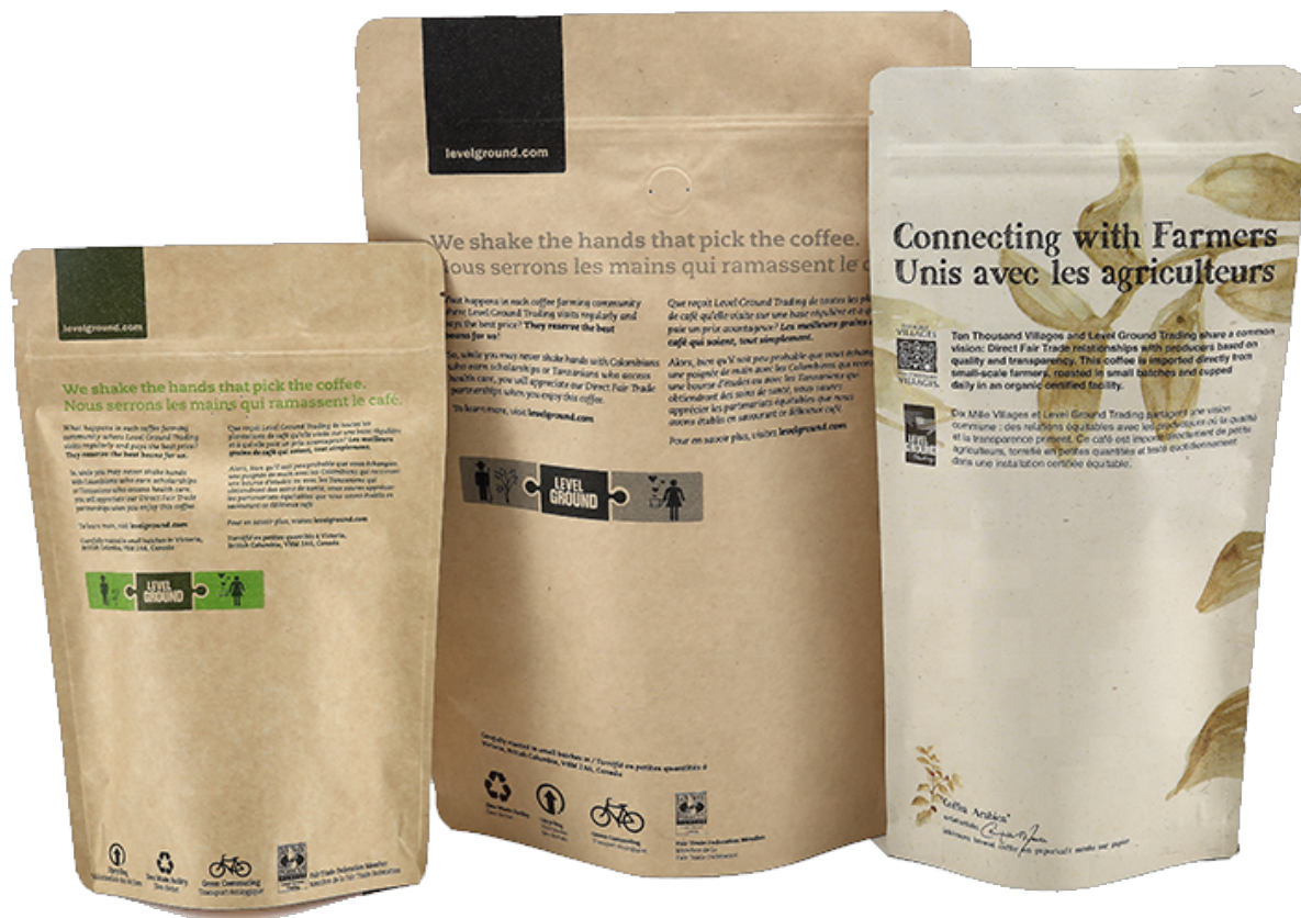
The detail data of Coffee packaging bags