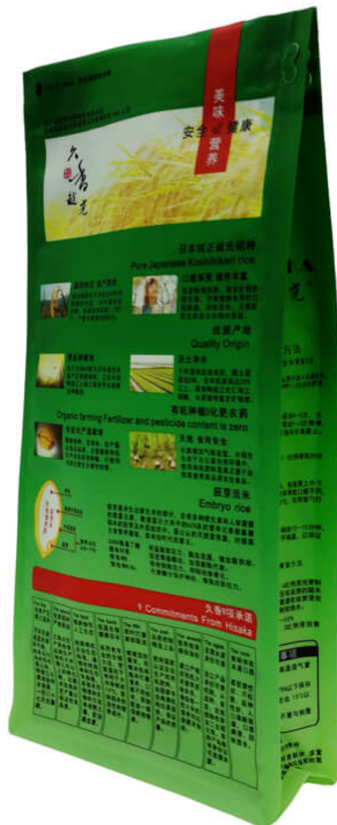
The detail data of rice packaging bags