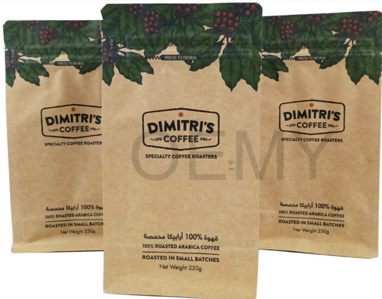
OEM square bottom kraft paper coffee powder packaging bags

They are not only packaging bags for your coffee powder or coffee bean. They are also the carrier of your company's brand, mobile advertising, value communication. The most importance is that it is environmentally friendly.