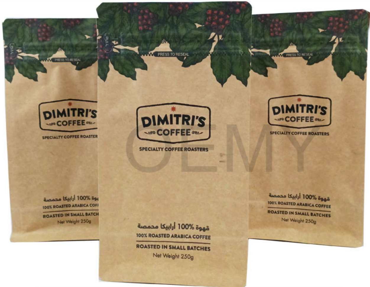
OEM square bottom kraft paper coffee powder packaging bags

They are not only packaging bags for your coffee powder or coffee bean. They are also the carrier of your company's brand, mobile advertising, value communication. The most importance is that it is environmentally friendly.