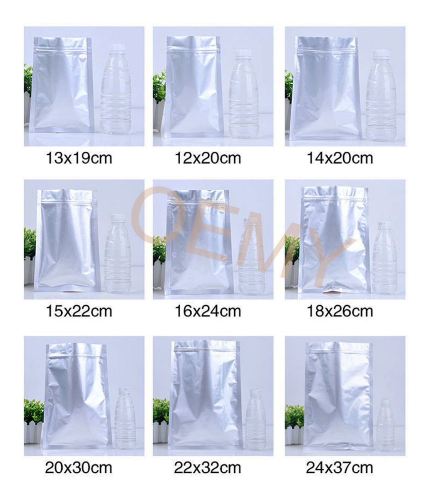
The Application of packaging bags